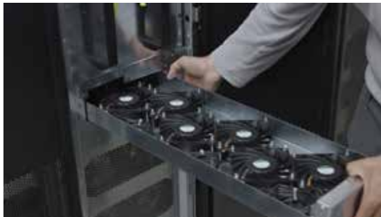
N+1, fault-monitored fan assembly housed in cable-free slide-out drawer for maximum reliability and easiest maintenance.

For flexibility and additional resilience, each DPA™ module can be fed from an independent or common battery system