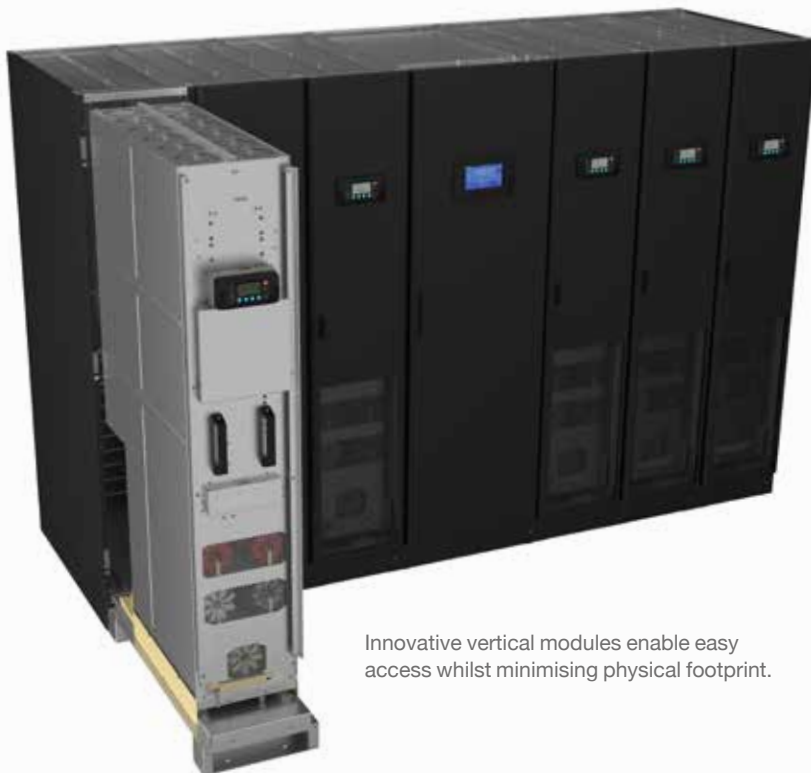
Innovative vertical modules enable easy access whilst minimising physical footprint.

That protection is achieved with best-in-market 97.4% VFI energy efficiency, reducing environmental impact, optimising PUE measures and delivering significant financial savings in energy and cooling costs.