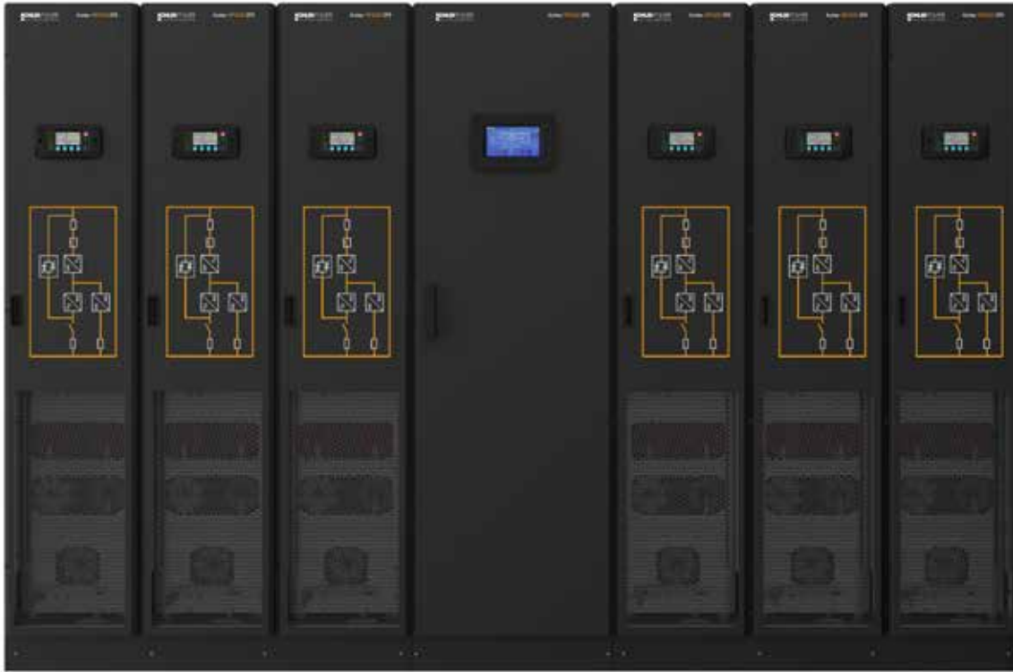
A 1.5MW MF1500 DPA with a central connections cabinet flanked by six 250kW modules, each containing all elements of a UPS.