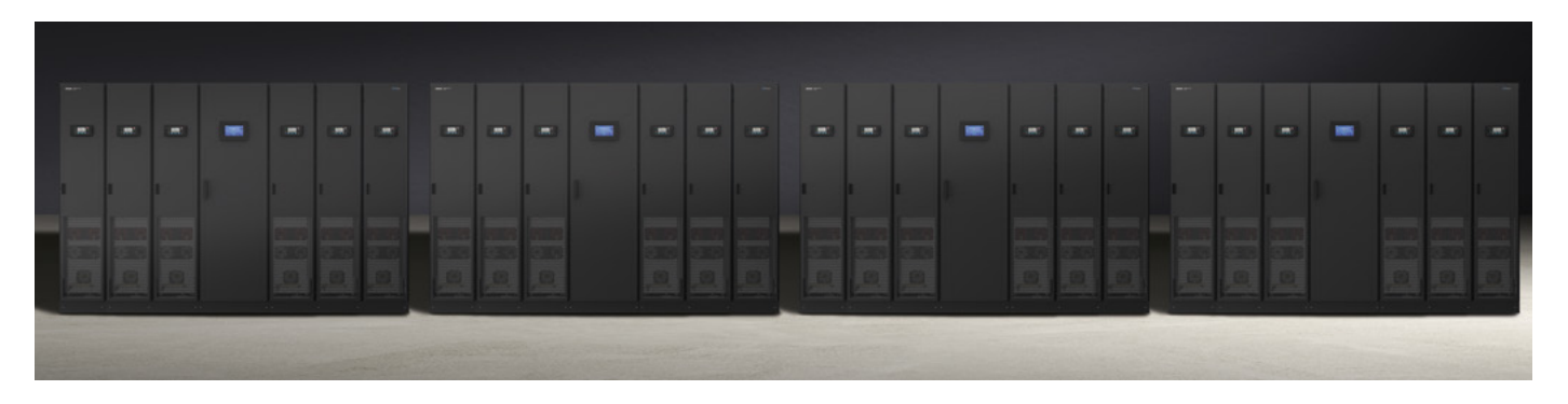
Up to 6.0 MW

1.0MW and 1.5MW frames and 250kW modules allow scaling to match your load, from 250kW to 6.0MW.