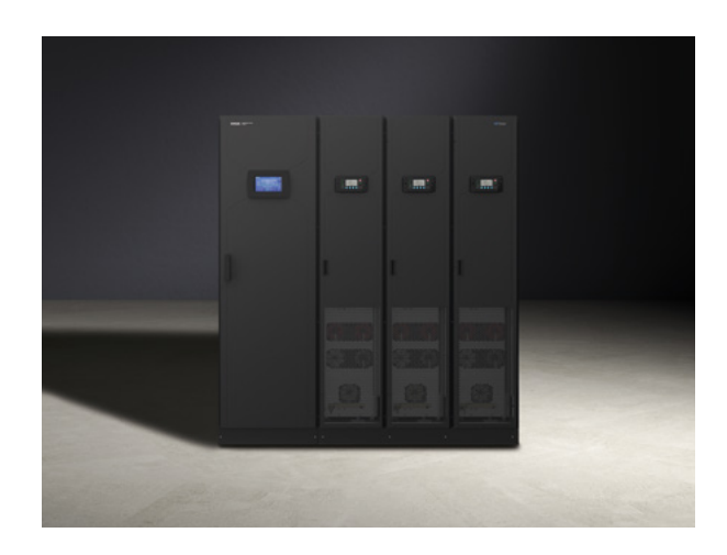
0.75 MW RHS and LHS connections available