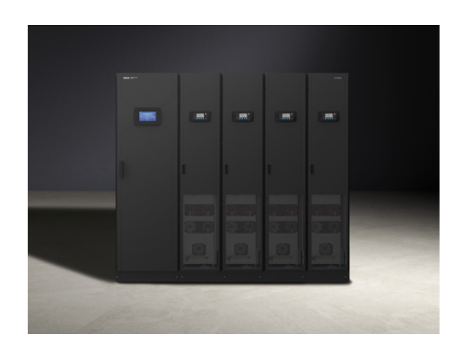
1.0 MW RHS and LHS connections available