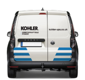
Exceptional 24/7/365 Service Support