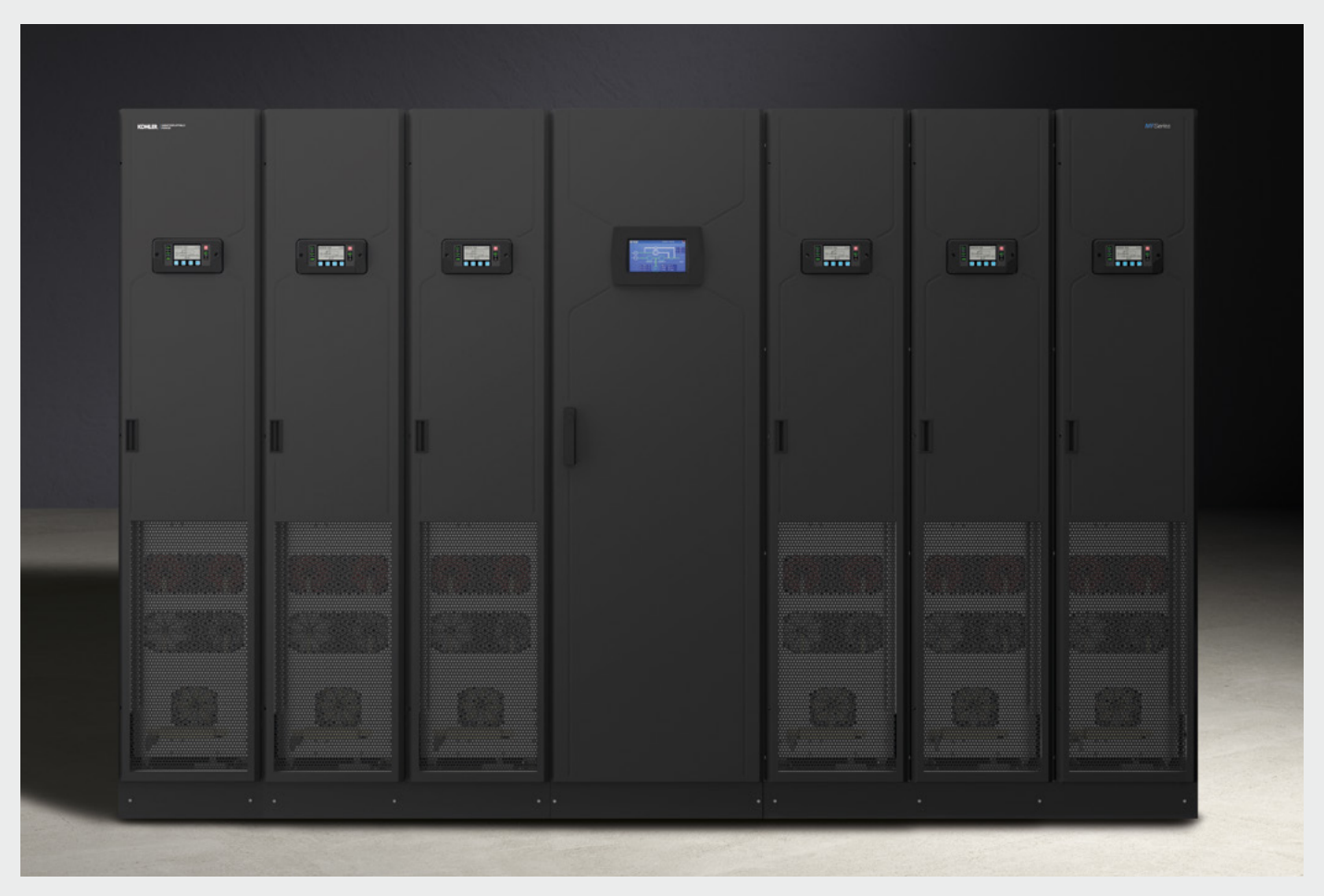
A 1.5MW KOHLER MF Series with a central connections cabinet flanked by six 250kW modules, each containing all elements of a UPS.